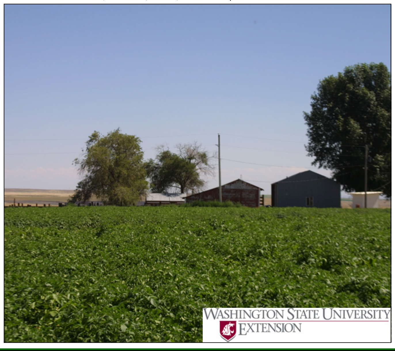
Potato field, Prosser, WA